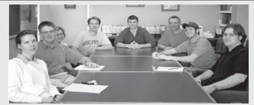
The Developmental Biology Group

Furthermore, because of the interdisciplinary character of the teams' research, which ranges from computational finance and image processing to biomathematics and gene networks, students will have the opportunity learn about interdisciplinary communication as well as traditional types of presentations and reports. Communication is at the heart of interdisciplinary work, essential in negotiating problem definitions, research designs, interpretation of evidence, and presentation of results. Experience with these types of communication can provide students